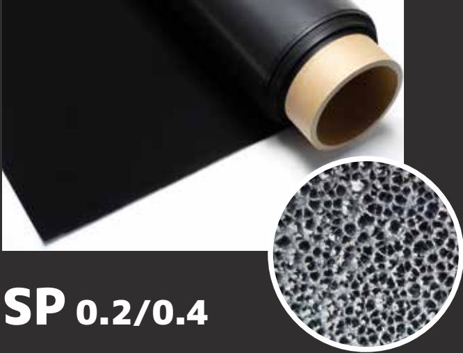
SP 0.2/0.4 Standard Grade