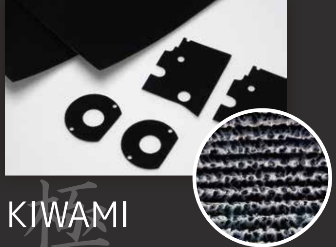
KIWAMI High Grade